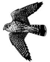
Merlin