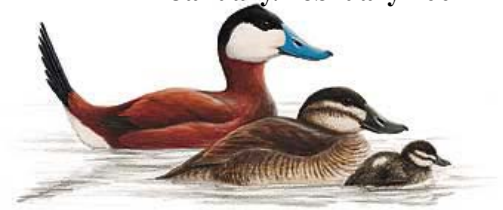
Jón Baldur Hlíöberg

B u e n a V i s t a A u d u b o n S o c i e t y