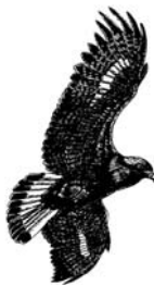
Golden Eagle, Juv.

Join expert guides to see multiple species of migrating and resident raptors at the Ramona Grasslands on Saturdays from 9 a.m.-noon during January and February. The Wildlife Research Institute in Ramona is presenting its free winter educational program on the county's hawks. Nineteen different species of raptors have been recorded at this raptor hotspot.