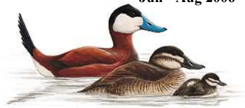
Jón Baldur Hlíöberg

B u e n a V i s t a A u d u b o n S o c i e t y