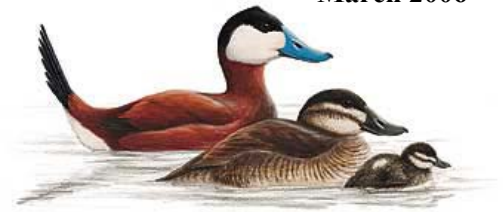
Jón Baldur Hlíðberg

B u e n a V i s t a A u d u b o n S o c i e t y