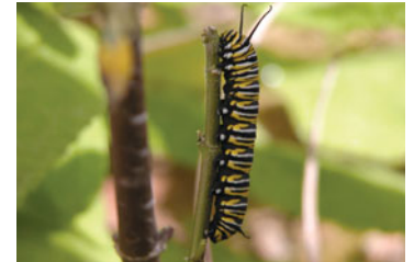
Monarch butterfly caterpillar on Asclepias spp.

Attracting butterflies to your garden is a rewarding way to foster a healthy population of beneficial insects. Witnessing the arrival of the graceful, multicolored beauties in your yard is evidence that by providing habitat and eliminating the use of chemical sprays, nature can restore balance to itself. Drought tolerant native plants are beneficial for species-specific native butterflies that depend on just one or a few types of plants as larval hosts.