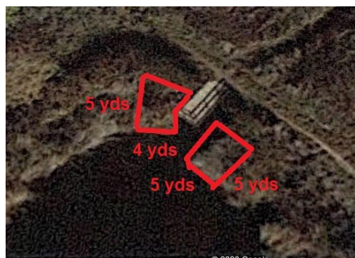
East dock cattail removal area

Prolific cattail growth is encroaching on the pond, impacting the open water. Approximately 85 square yards of cattails need to be removed from the duck pond around the two docks. The images below show the amount and location of cattail removal for each dock.