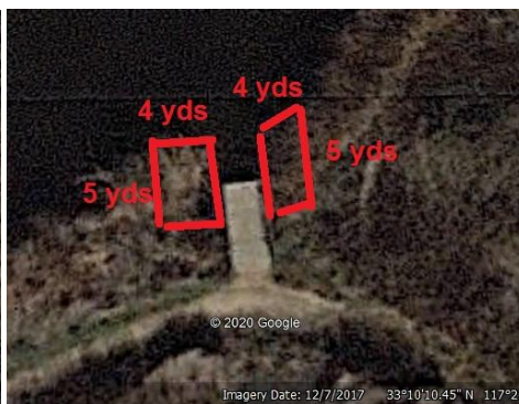
South dock cattail removal area